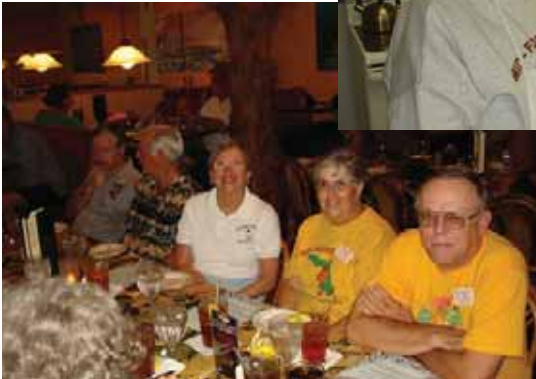
Annual Lunch and Meeting at Straubs Restaurant