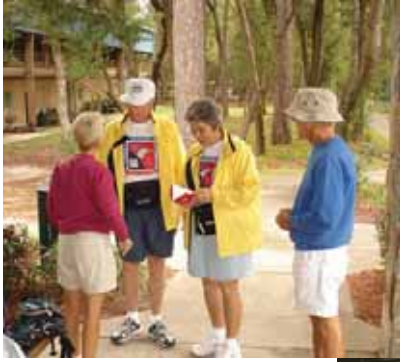
New Years Day 2007 Walk at Sanlando Park