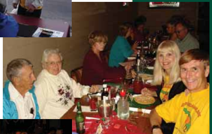
MFM 2007 Holiday Dinner at Roadhouse Grill ▶