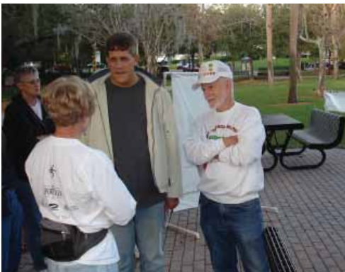
Maitland Christmas Night Walk