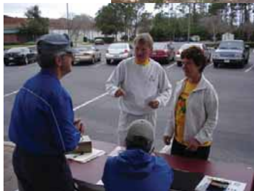
Lake Buena Vista Walk